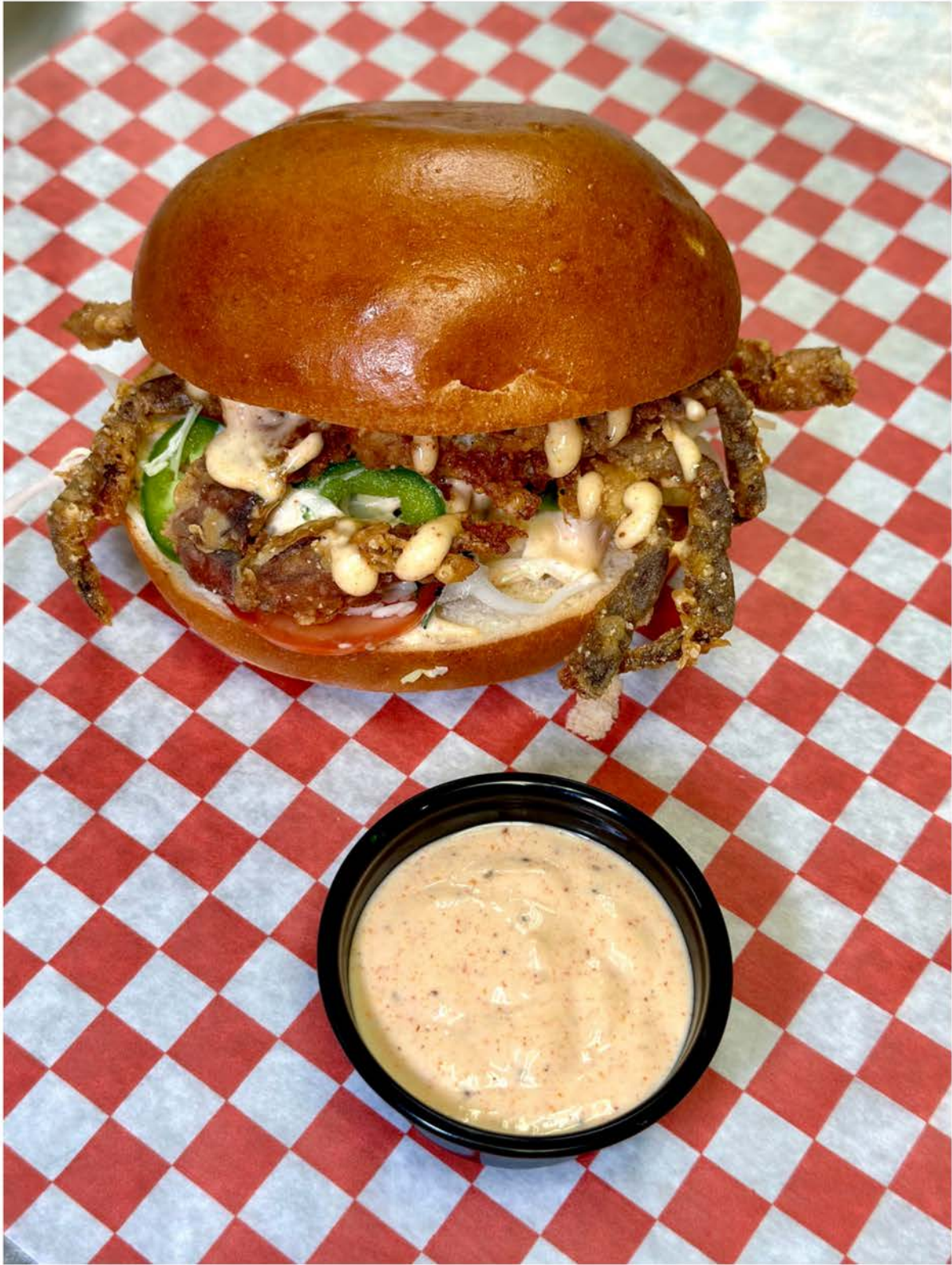
Pictured: Soft Shell Crab Torta with Old Bay Aoli Dressing (fries not pictured)