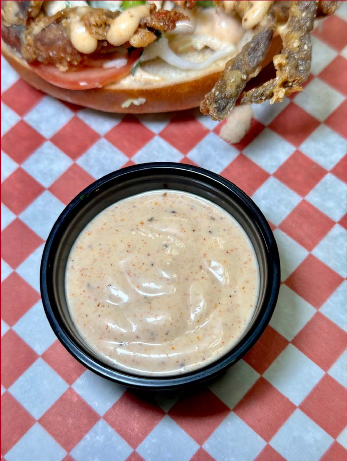
Pictured: Old Bay Aoli Dressing